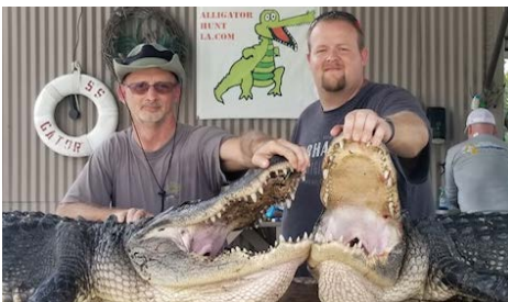
Machine Shop Summer Stories, pg. 7