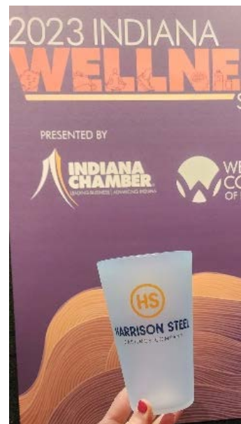
Paula Cheatham & Crystal Niccum—Wellness Summit in Indianapolis