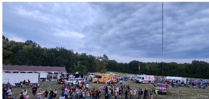
Aerial view from hot air balloon