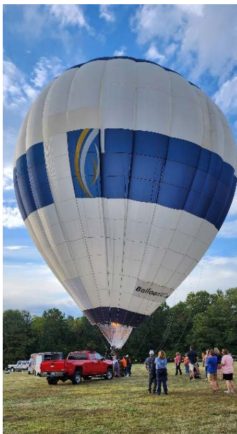
Tethered Hot Air Balloon Ride