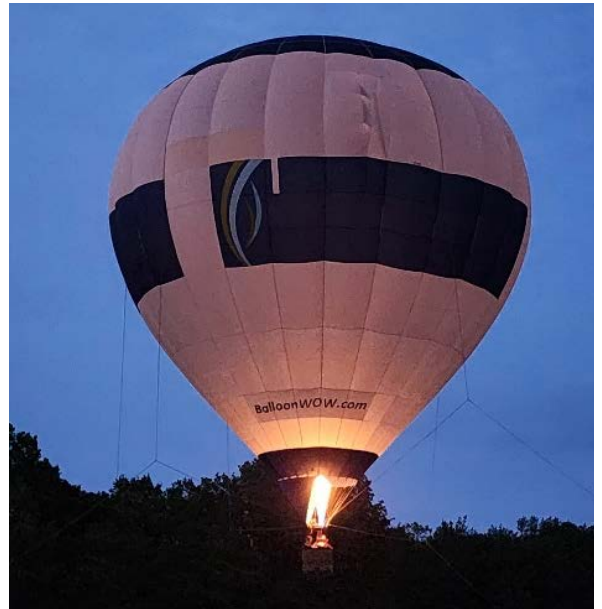
Company Picnic, Back Cover