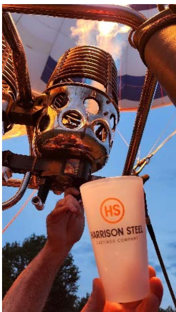
Brian & Crystal Niccum—Hot Air Balloon Ride at HSC Company Picnic