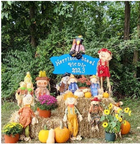
Gate Welcome Committee

The Harrison Steel Company Picnic on Saturday, September 16, featured food trucks, fun activities for the kids, a tethered hot air balloon ride, and a live band. The night ended with a spectacular fireworks display. Employees, family, & friends sure seemed to have a lot of fun!