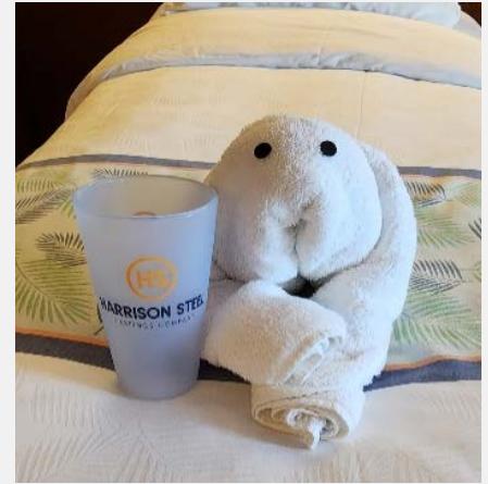
With a friendly towel animal