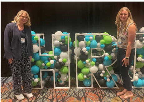
News from HR, pg. 2