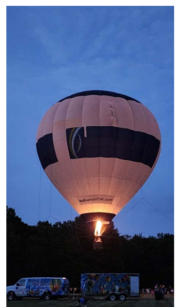
Night Glow of the Hot Air Balloon