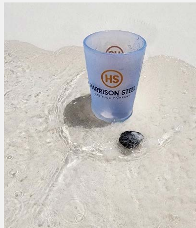
Taking a dip in the ocean