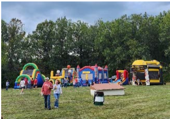
Play Area for Kids