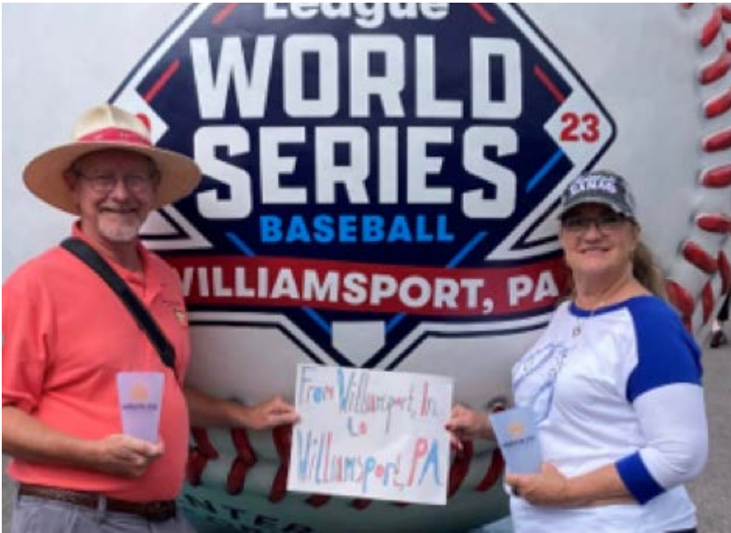
Sili Cup Adventures, pgs. 4-5