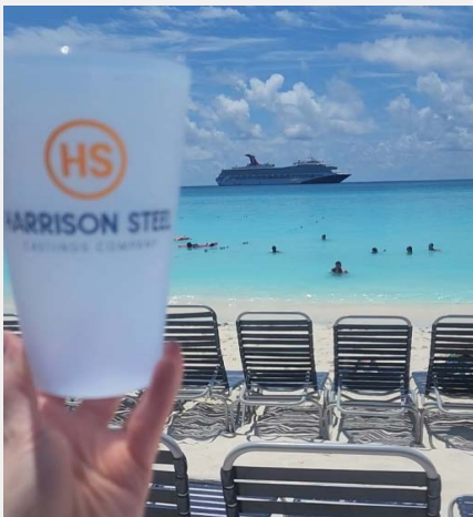
Selfie with the cruise ship at Half Moon Cay