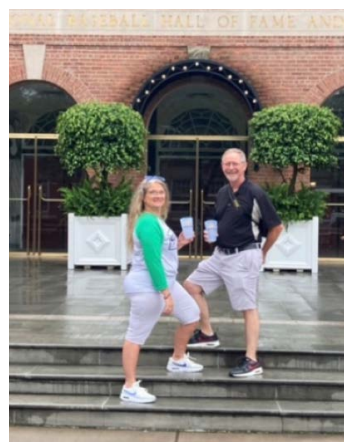
George Vredenburg II - Cooperstown Hall of Fame