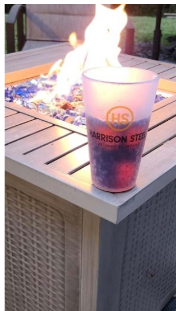
Brian & Crystal Niccum—Sitting By the Fire