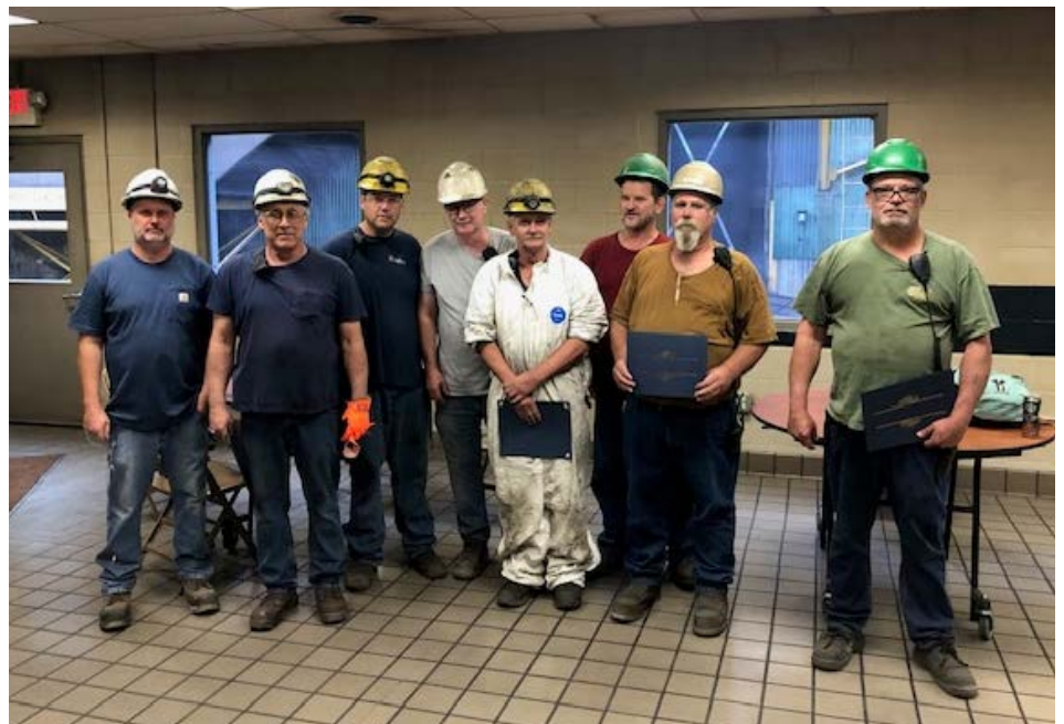
HS Employees Recognized for Safety, pg. 3