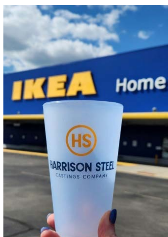
Paula Cheatham—Shopping at IKEA