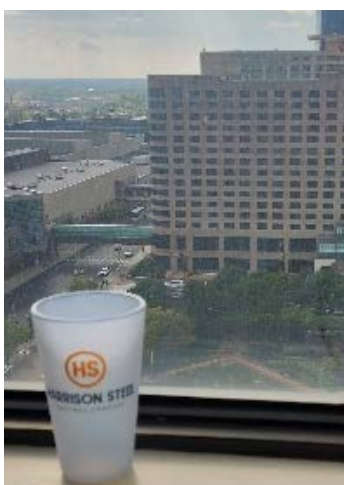
View of Downtown Indianapolis