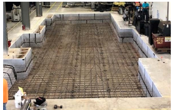
the foundation of the new machine just before the concrete pour.

Thanks to everyone for your patience and help with the installation of all of these new projects. Have a great Fall!