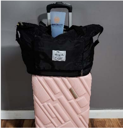
Sili cup packed and ready to go

Crystal Niccum took her Sili cup on a cruise to the Bahamas for an adventure.