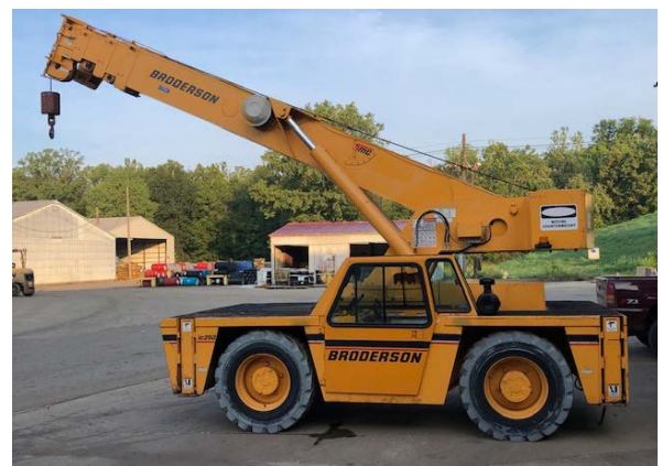
The new Broderick IC-250 crane