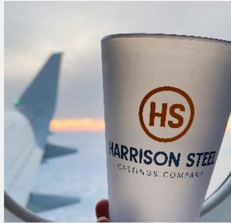
On the plane